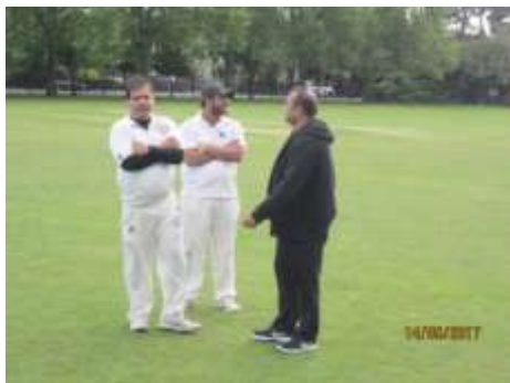
That's another fine mess we've gotten ourselves into. The Gents contemplate the carnage